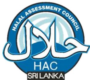
Arabic Halal logo