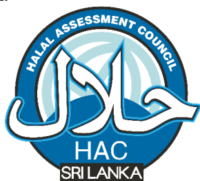
Arabic Halal logo